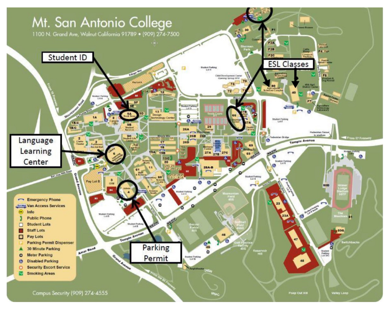
3 places that you need to visit